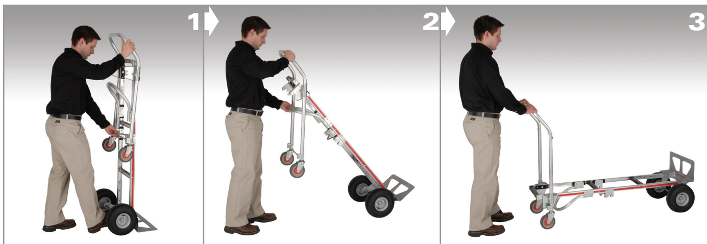
Press release latch