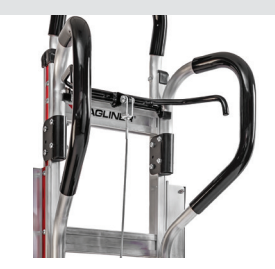
Handle-mounted cable release deploys and retracts back wheels without removing hands from handle. Available for B5 handle option only.